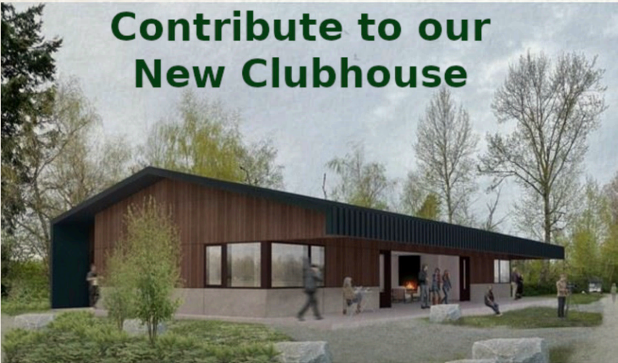
The Future of the Vancouver Gun Club