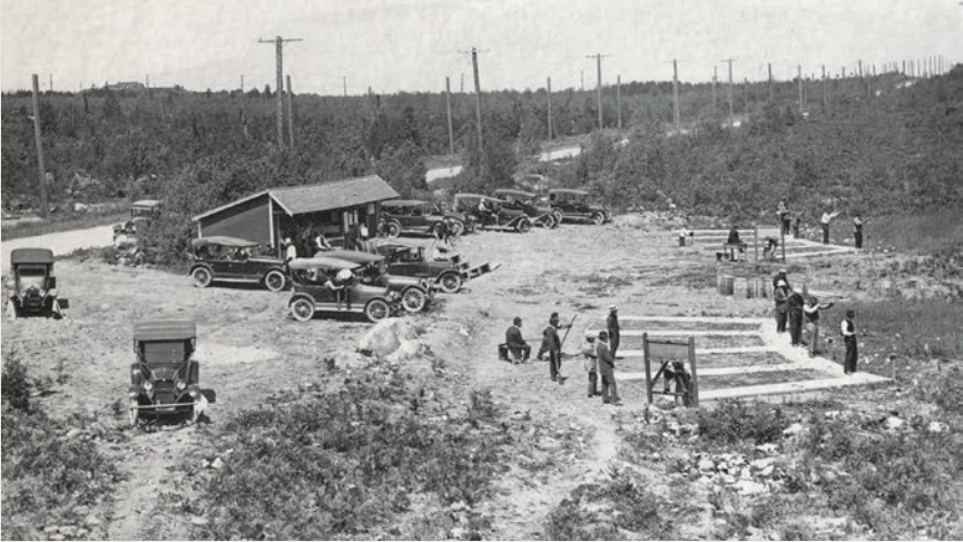
Trap shooting at the Vancouver Gun Club Oak Street and 45th Avenue